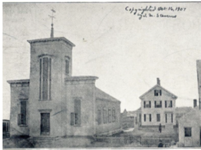
New church building built in 1867.