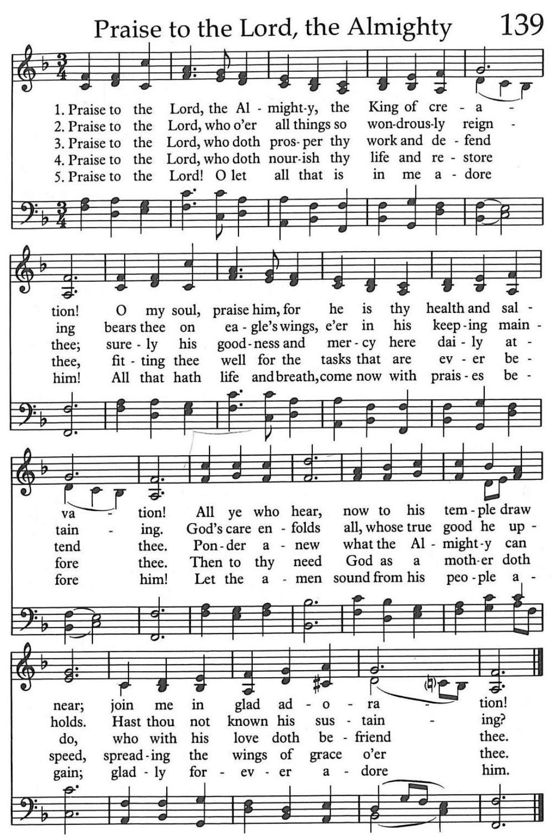
Words: Joachim Neander, 1680; stanzas 1, 3, & 5 translated by Catherine Winkworth, 1863, public domain; stanza 2 was translated by S. Paul Schilling, 1986, and stanza 4 was translated by Rupert E. Davies, 1983. Translations of stanzas 2 and 4 © 1989 The United Methodist Publishing House. Used by Permission; Music: Public Domain; Reprinted and recorded with permission under OneLicense.net # A-711296.