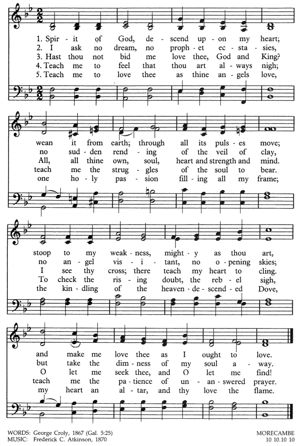
500 Spirit of God, Descend upon My Heart

Words and music are in the public domain; permission to reproduce for worship bulletins is granted under the provisions of The United Methodist Hymnal and United Methodist Publishing House; PO Box 801, Nashville TN 37202