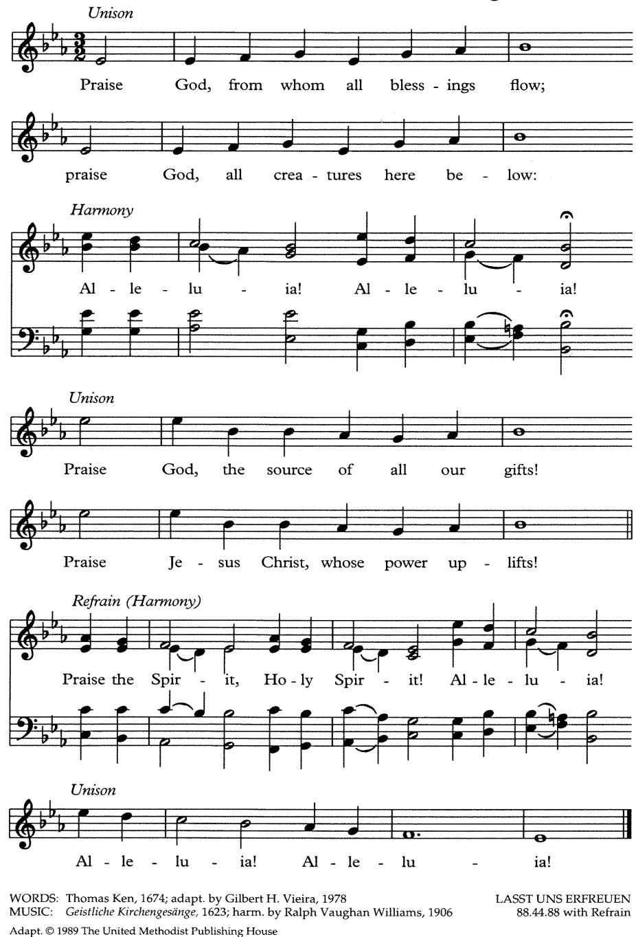
Reprinted and recorded with permission under <u>OneLicense.net # A-711296.</u>